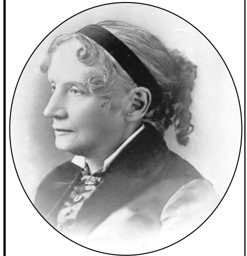
Harriet Beecher Stowe

If you want to add your own information, instead of folding here, cut here.