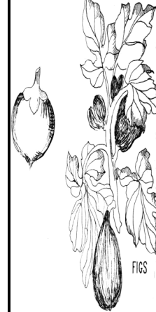
Fig (Jeremiah 24:2)

This could be a variety of plants. Some scholars think hemlock or poppy. Mark's gospel, Mark 15:13 shows Jesus refused drugged wine with myrrh.