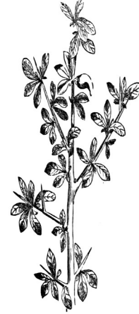
Myrrh (Mark 15:13)